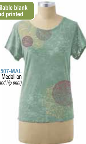
1600-507-MAL Large Medallion (shoulder and hip print)