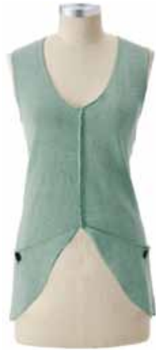
1035 Sri Lanka Vest This unique vest-like top has functional front with a v-neckline and a high-low hemline. Fabric: 55 % hemp / 45% organic cotton jersey Colors Available: Black, Malachite, Mud, Sunstone, Topaz, Turquoise, Violet Sizes: s,m,l,xl