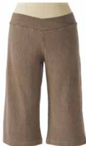
2013 Global Gaucho This cropped pant has a slightly flared hemline and a very flattering criss-cross waistband. Fabric: 55 % hemp / 45% organic cotton jersey Colors Available: Black, Malachite, Mud, Sunstone, Topaz, Turquoise, Violet Sizes: s,m,l,xl