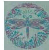
1053-136-MAL Stamped Dragonfly