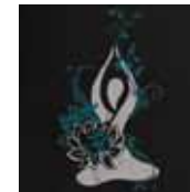
1053-137-BLK Lotus Pose