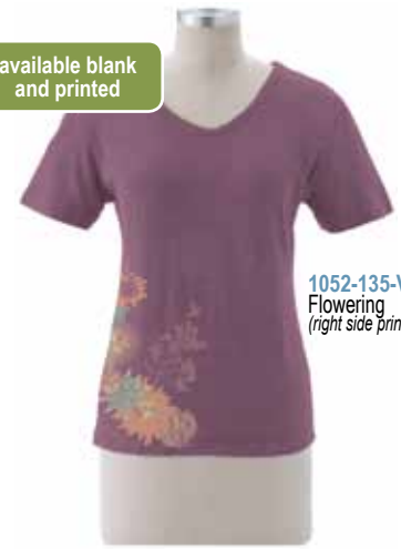
1052-135-VIO Flowering (right side print)

1052 Better Than Before Scoop This scoop-neck tee has a flattering fit and a great length.