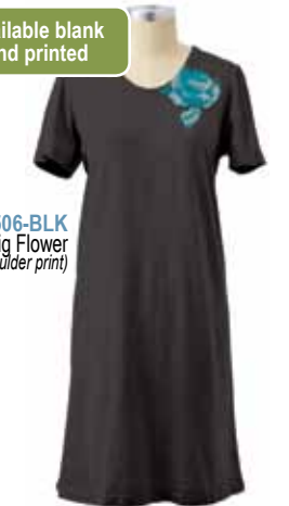
3504-506-BLK Big Flower (left shoulder print)