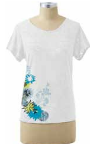
1600-135-WHT Flowering (right side print)