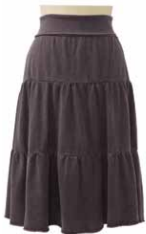
2014 Sunchaser Skirt Cute three panel skirt with gathers reminiscent of long summer days all year round. Throw it on with a pair of boots or sandals. Fabric: 55 % hemp / 45% organic cotton jersey Colors Available: Black, Malachite, Mud, Sunstone, Topaz, Turquoise, Violet