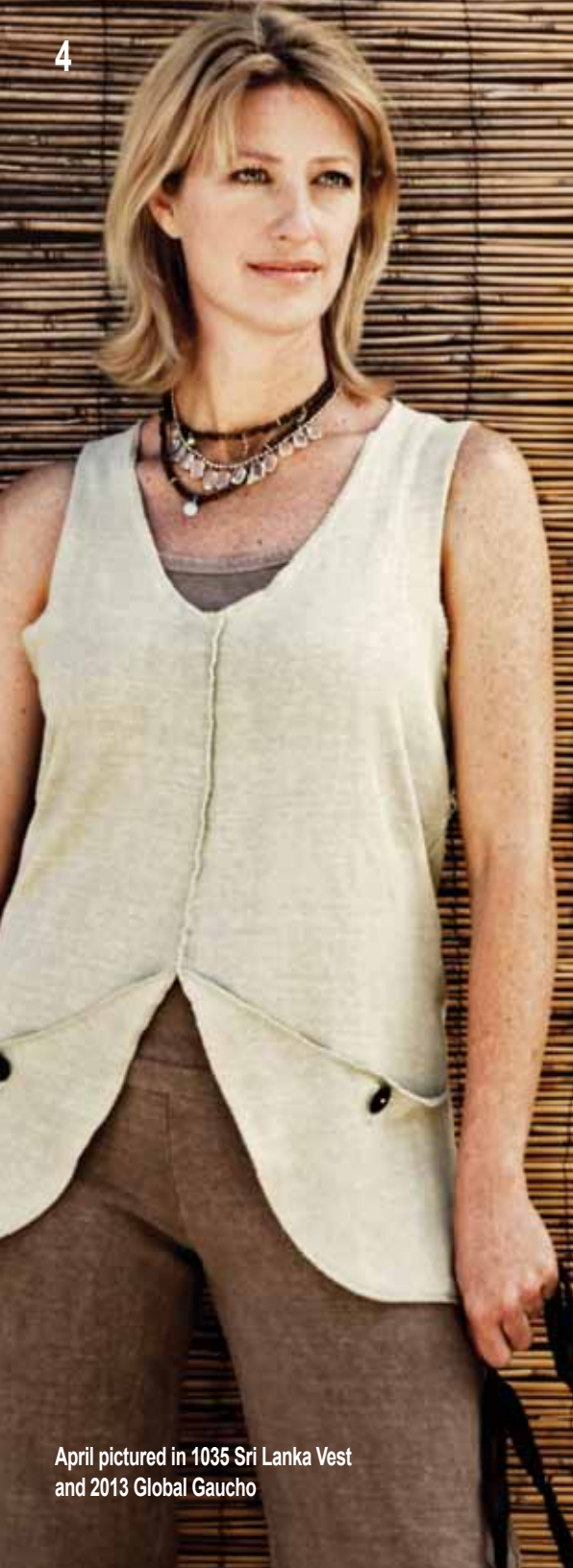
April pictured in 1035 Sri Lanka Vest and 2013 Global Gaucho