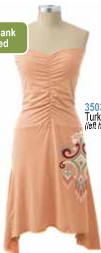
3503-518-SUN Turkish Dreams (left hip print)

3503 Soulful Tank Dress/Skirt A very complimentary dress, with ruching down the center front. The bodice is made out of lycra that can be rolled down and converted to a skirt. A great three season piece. Fabric: 100% organic cotton jersey Colors Available: Azurite, Black, Malachite, Mud, Sunstone, Topaz Sizes: s,m,l,xl