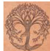
1053-709-SUN Tree Pose