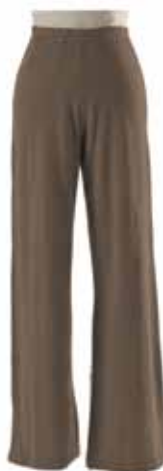
2032 Fab Fit Pant This is a full-length, great-fitting pant with an elastic waistband.

Fabric: 55 % hemp / 45% organic cotton jersey Colors Available: Black, Malachite, Mud, Topaz, Turquoise