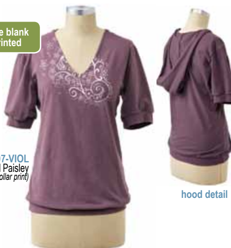
1416-097-VIOL Neck Aged Paisley (collar print)