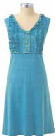
3003 Daisy Dress This knee-length dress has a v-neckline with button closure and rows of ruffles down the front. A great summer dress.

Fabric: 55 % hemp / 45% organic cotton jersey Colors Available: Black, Malachite, Sunstone, Topaz, Turquoise, Violet