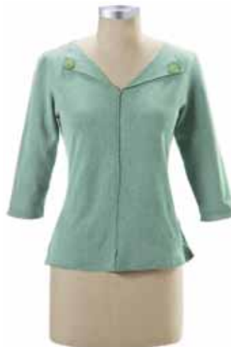
1072 Voyage V-neck This gotta have top has a non-functional button down v-neck collar in the front and three quarter length sleeves

Fabric: 55 % hemp / 45% organic cotton jersey Colors Available: Black, Malachite, Sunstone, Topaz, Turquoise, Violet