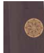
2508-702-MUD Moroccan Circle (pocket print)