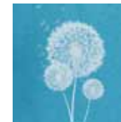
1053-843-TUR Three Wishes (off center print)