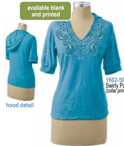
1602-509-AZUR Swirly Paisely (collar print)