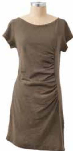
1023 Venus Top (cap sleeves) This unique tunic has a flattering, gathered front seam line and small slit at the hem. It fits like a dream, and looks great with leggings or jeans.

Fabric: 55 % hemp / 45% organic cotton jersey Colors Available: Black, Malachite, Sunstone, Topaz, Turquoise, Violet