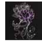
1052-056-BLK Lotus Flower (off center print)