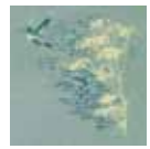
1052-057-MAL Bird Diary (off center print)