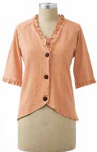
1005 Katie Cardigan Our new raglan sleeve cardigan has a v-neckline and a high low hemline with a decorative ruffle around the neck and sleeves. Fabric: 55 % hemp / 45% organic cotton jersey Colors Available: Black, Malachite, Sunstone, Topaz, Turquoise, Violet