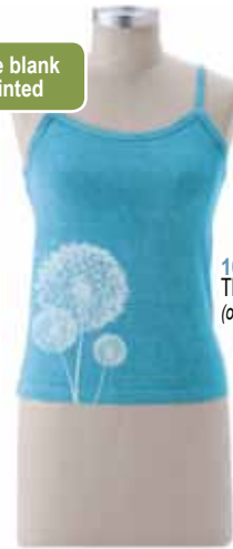
1053-843-TUR Three Wishes (off center print)

1053 Tank Top Our strappy tank is a must-have basic that looks great on its own or worn under our cardigans, wraps, and pullovers.