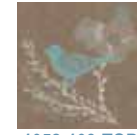
1052-103-TOP Vintage Bird (off center print)